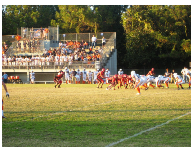
Christian schools from around the country will compete for a National Championship

Tuesday, Nov 8th, 2011 thru Friday, Nov 11th, 2011