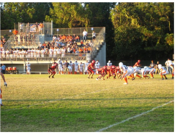
Christian schools & Christian homeschool teams will compete in the 2012 National High School Football Tournament

Tuesday, Nov 13th, 2012 thru Friday, Nov 16th, 2012