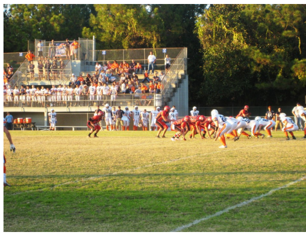
Christian schools & Christian homeschool teams will compete in the 2013 National High School Football Tournament

Tuesday, Nov 12th, 2013 thru Friday, Nov 15th, 2013