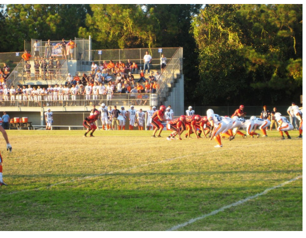
Christian schools & Christian homeschool teams will compete in the 2014 National High School Football Tournament