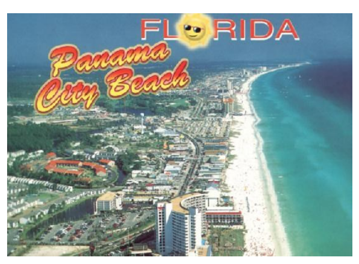
Panama City Beach, Florida

Costs includes room for 4 nights and breakfast on Saturday, Sunday and Monday. There is Awards Ceremony on Monday after Championship game.