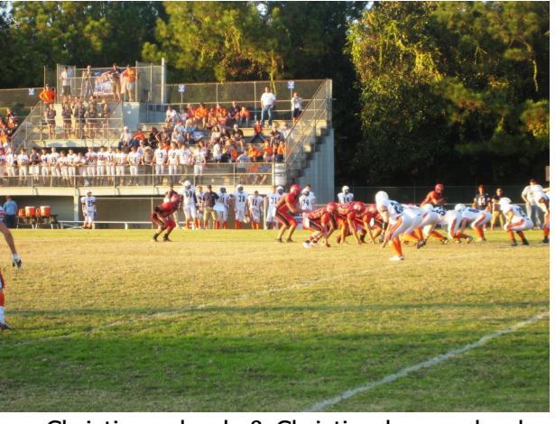
Christian schools & Christian homeschool teams will compete in the 2017 National High School Football Tournament

Friday, Nov 10th, 2017 thru Monday, Nov 13th, 2017