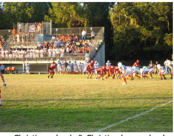
Christian schools & Christian homeschool teams will compete in the 2017 National High School Football Tournament

Friday, Nov 10th, 2017 thru Monday, Nov 13th, 2017