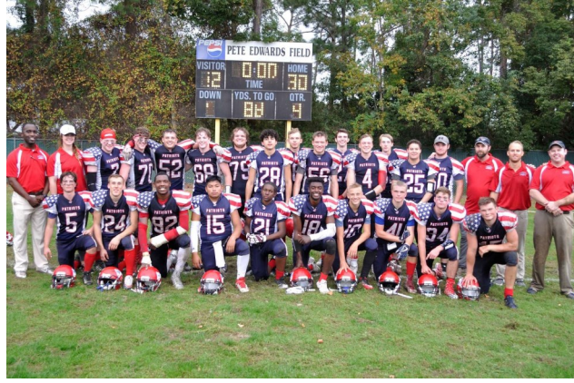
2017 NHSA Champions OKC Patriots

Friday, Nov 9th, 2018 thru Monday, Nov 12th, 2018