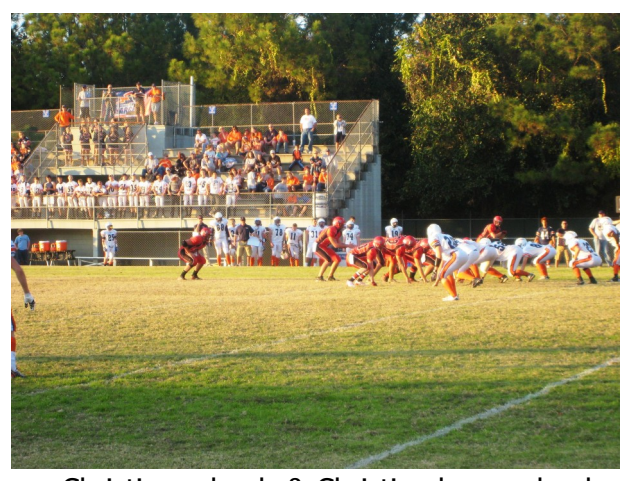
Christian schools & Christian homeschool teams will compete in the 2024 National Tournament

Wednesday, Nov 13th, 2024 thru Sunday, Nov 17th, 2024