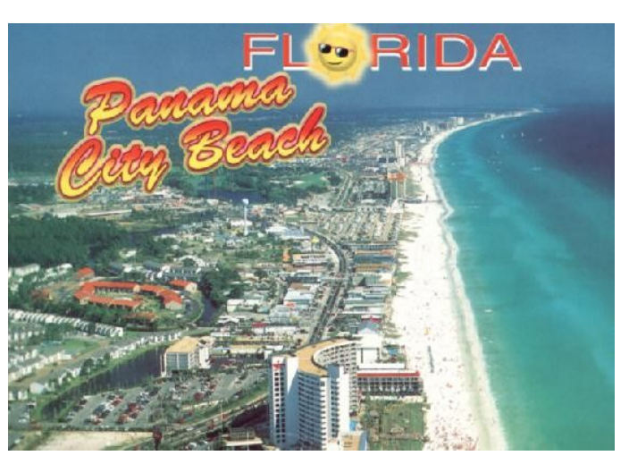
Panama City Beach, Florida

Costs includes room for 4 nights and breakfast on Thursday, Friday & Saturday. There will be Awards on Saturday after Championship game.